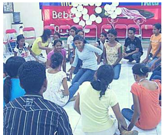
Image: Life skills training for young people

All images on this page are from Fundasaun Alola