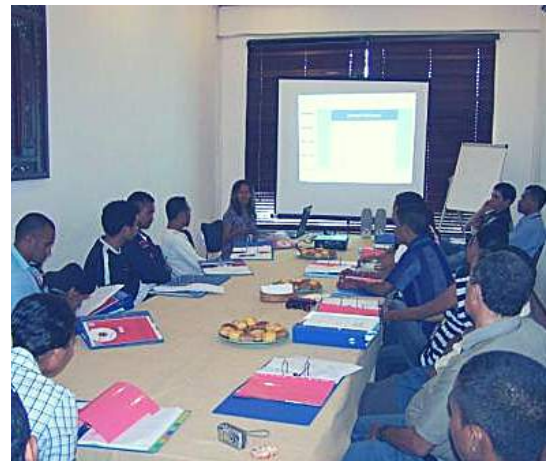
Image: Anti-trafficking training for Journalists