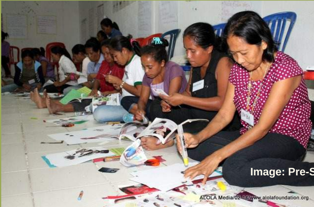
Image: Pre-School teachers in training