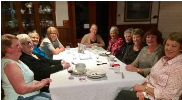
Members of the Phillip Island Inner Wheel Club at a soup and sweets night.

I had read an article in my husband's medical journal that said that 58 percent of children in Timor-Leste had stunted growth and rural children had limited food options. Our district decided to support this project. The clubs raise funds in their own way such as street stalls, BBQs, dinners, special functions or fashion parades. They then divide the money raised between projects. Our Phillip Island club has only 15 members, many of them single ladies, so I decided to have a monthly soup and sweets night . I made the soup, some of the ladies made sweets, everyone paid $15, everyone had a goodtime, and the money will help make children healthy in Timor-Leste.